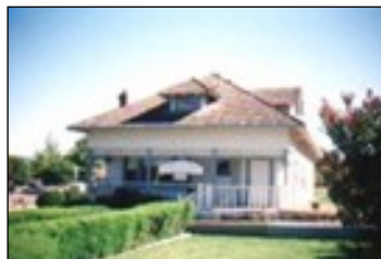
Renovated Museum on West Main Ave.