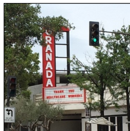
ON THE MARQUEES