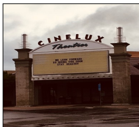
“WE LOOK FORWARD TO SEEING YOU SOON STAY HEALTHY”

Please go to https://www.morganhillhistoricalsociety.org/pandemic-project-description for more information and to submit the donation form. Visit us and enjoy the Museum and all that it has to offer: archives to artifacts, exhibits and educational programs.