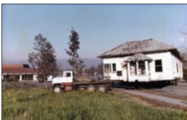
The Move to West Main Ave.

In September 2005, the Morgan Hill Museum was moved a second time to the Villa Mira Monte property to make way for the new library. With support from City redevelopment funds, a County grant, and the community, the Morgan Hill Museum was moved, renovated and reopened to the public in 2008.