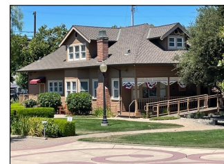
Museum after move and renovation at Villa Mira Monte