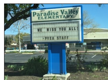
“WE MISS YOU ALL! PVEA STAFF”